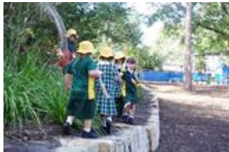
Prep uniform with yellow hat

These items are available from the uniform shop in the amenities block in the centre of the school. Opening times can vary so if you are not sure, please check with the school office.