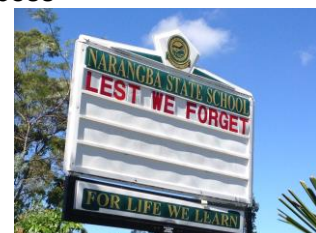
We commemorate ANZAC Day